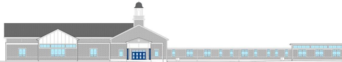
Street view Library and 6 th /7 th grade wing