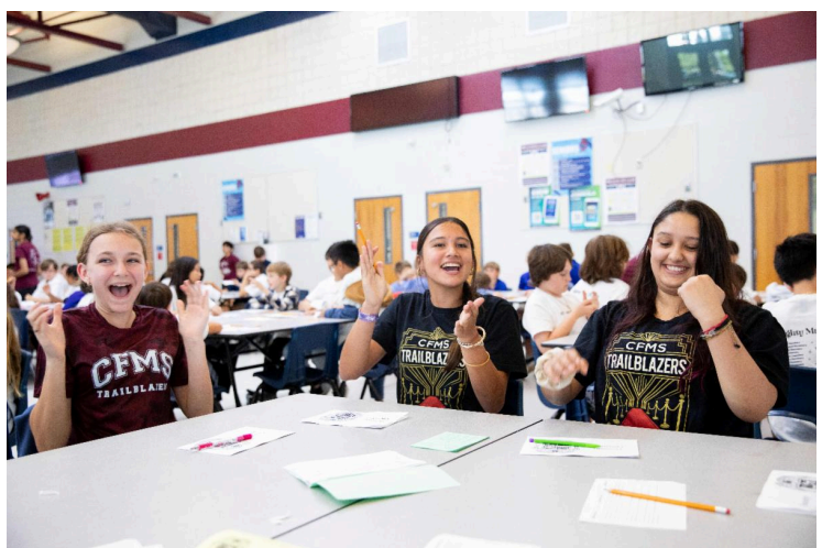
Mighty Mu makes math fun

Congratulations to the 2025-26 Rising Stars Finalists! Join the Pinellas Education Foundation on April 21 to watch talented Pinellas County Schools juniors and seniors take center stage at Mahaffey Theater, delivering show-stopping performances in