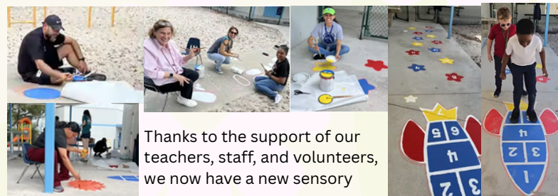
Thanks to the support of our teachers, staff, and volunteers, we now have a new sensory

path on the kindergarten playground! Sensory paths in schools provide structured, active “brain breaks” that help students regulate emotions, release excess energy, and improve focus—leading to greater classroom readiness.