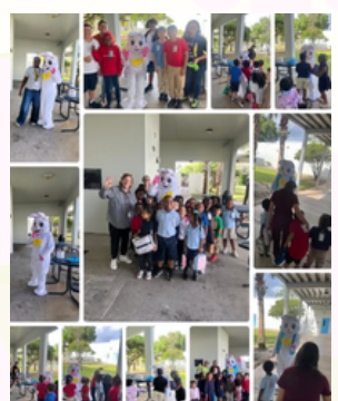
Thank you to our Community Partner -Miami Management, Inc for their continued support of MLE. Today our scholars were surprised with a visit from a special friend today!