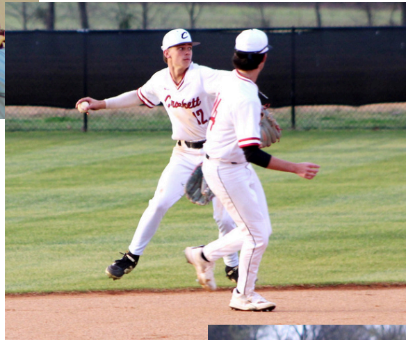
Left: ... and set his feet to throw from all the way over on the shortstop side of the base ...