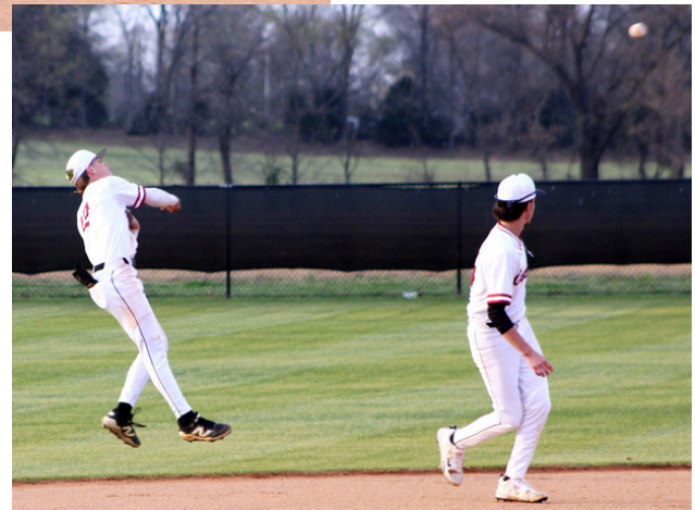
Below:... and then launched this throw that nearly beat the runner to first. It was to be Obion's only hit of the game.