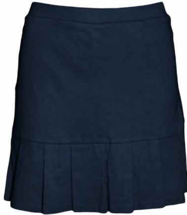
Navy Knit Skort

Just in time for Spring! Order today online or in-person!