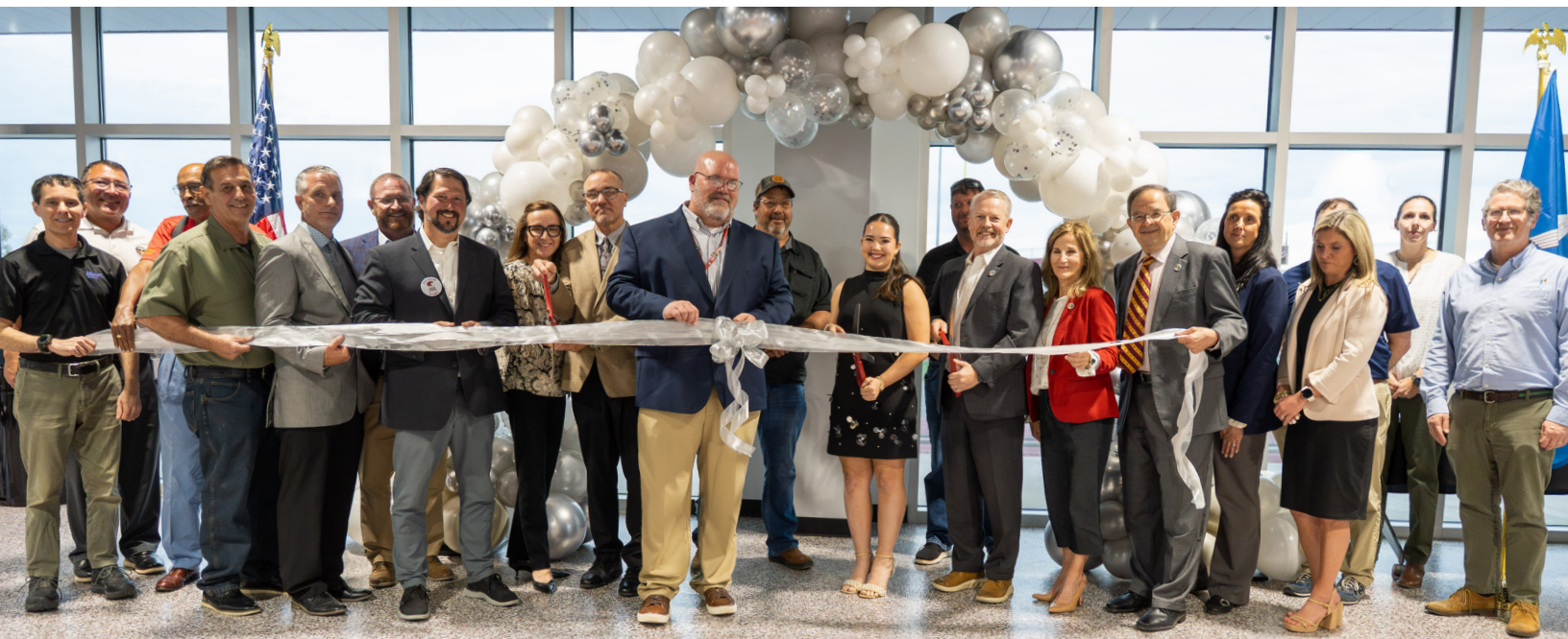
Ribbon-Cutting Ceremony at Destrehan High School Triple A Alumni Center