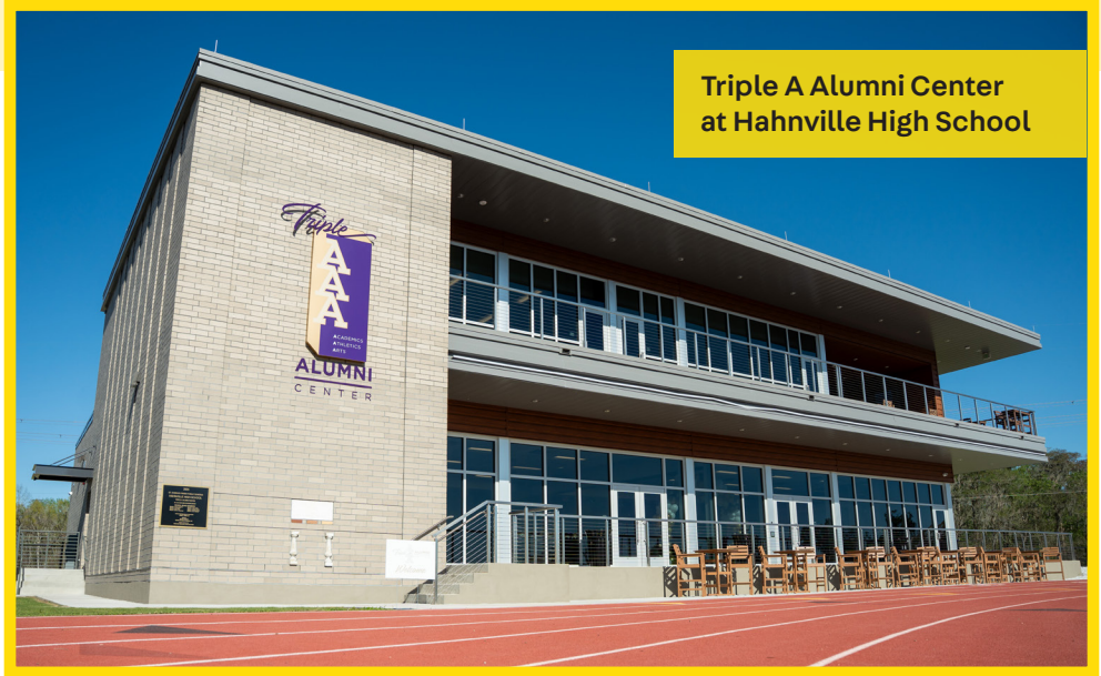
Triple A Alumni Center at Hahnville High School