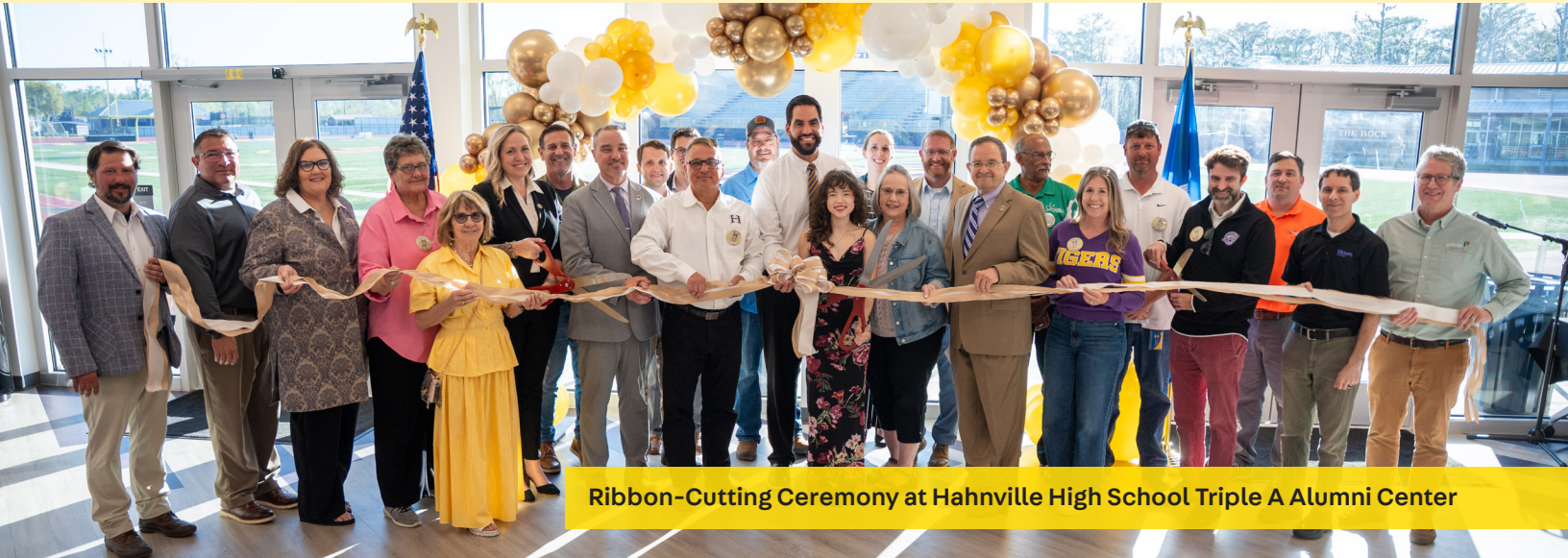
Ribbon-Cutting Ceremony at Hahnville High School Triple A Alumni Center