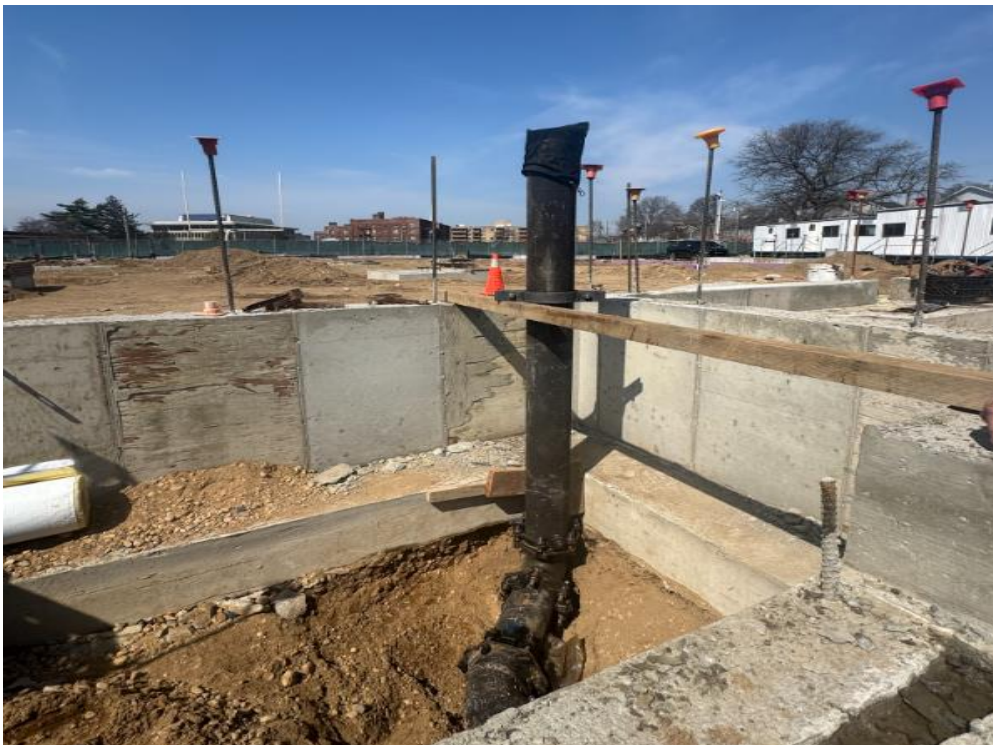
Hempstead ABGS MS – Drain Piping