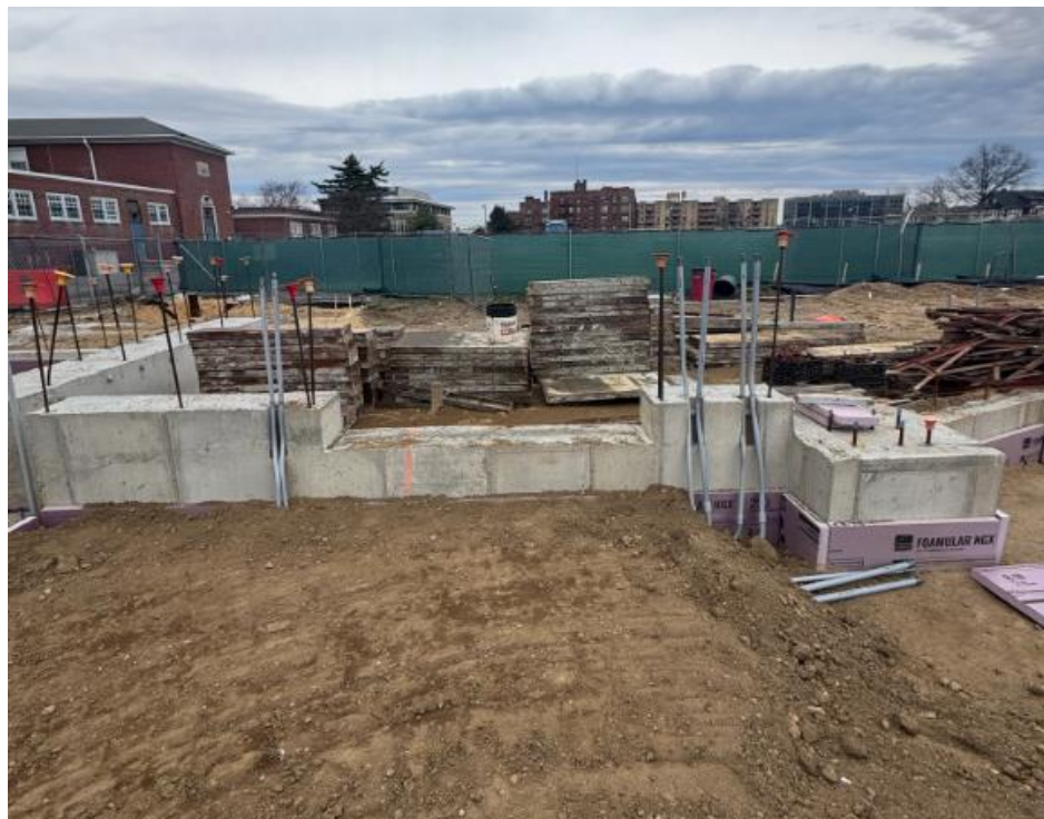
Hempstead ABGS MS – Foundation Walls