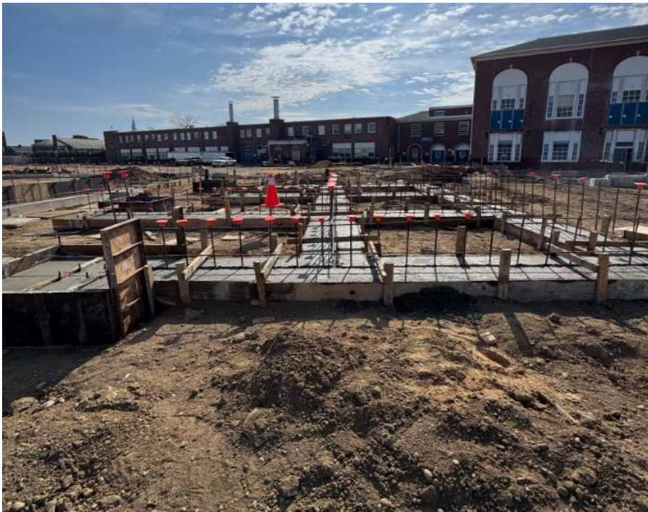
Hempstead ABGS MS – Interior Piers and Walls