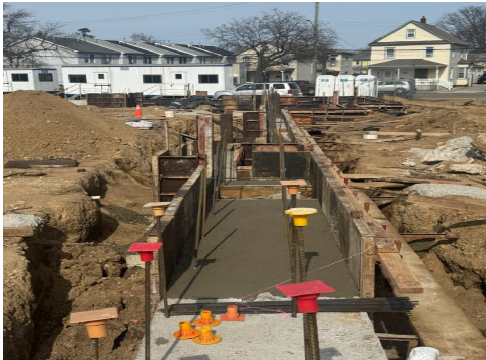
Hempstead ABGS MS – Foundation Walls