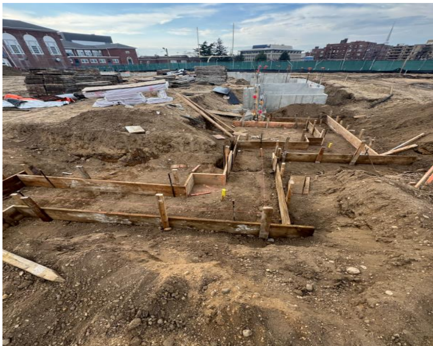
Hempstead ABGS MS – Footings