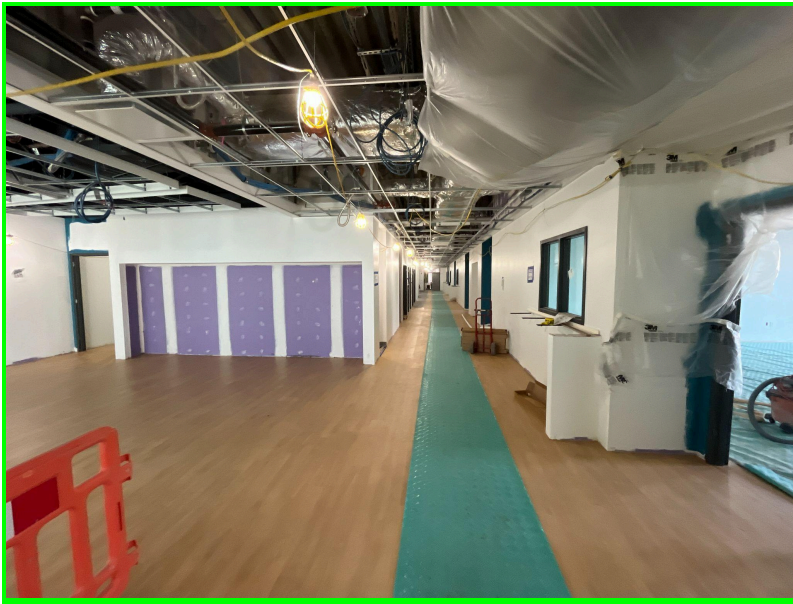
Floor installation ongoing at the 2nd floor classroom pod common/corridor(s)