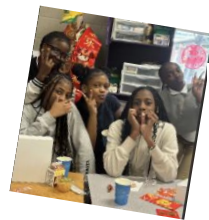
Chinese Lunar New Year Celebration in February!

CMS Chiefs are International Learners! Chiefs learn about other places and cultures in their daily lessons and through World Wise Moments, usually on Wednesdays. Volunteers choose a topic to share with their peers over the intercom during morning announcements. A synopsis of what they share is displayed in the hall if you would like to see what we have learned!