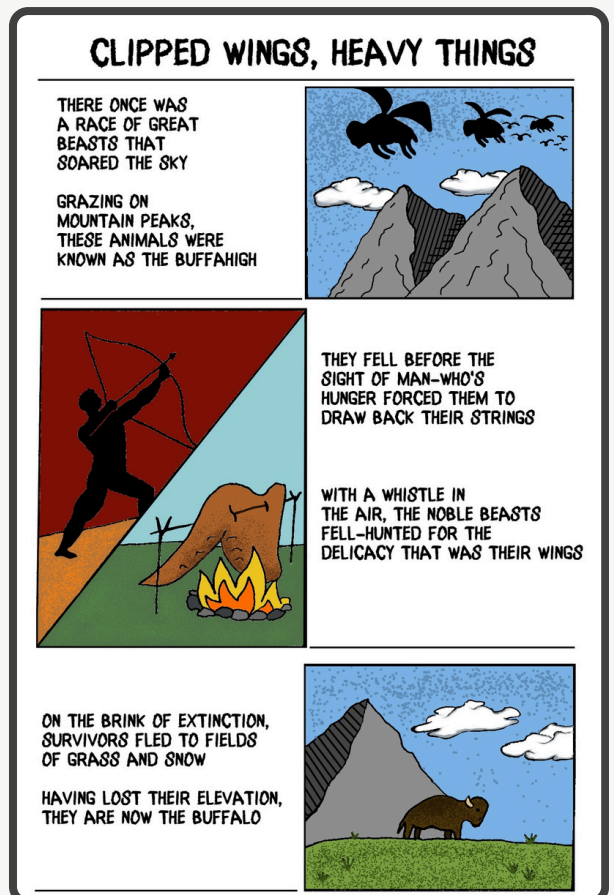
by Stirling Turnbull, 9th