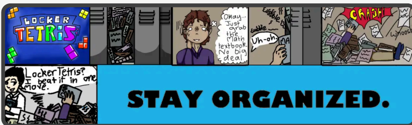
by Harper Drieling, 9th

For today's high school graduates, the message is clear: AI will reshape the future of work, but it will never mean the end of opportunity. Research future jobs you have considered and understand the effect AI will have on it in the future. Develop those valuable emotional and relational skills that will never be able to be replaced. Those that are willing to learn, adapt, and work alongside AI as it continues to develop in the future will be well positioned to greatly succeed in the ever-changing job market.