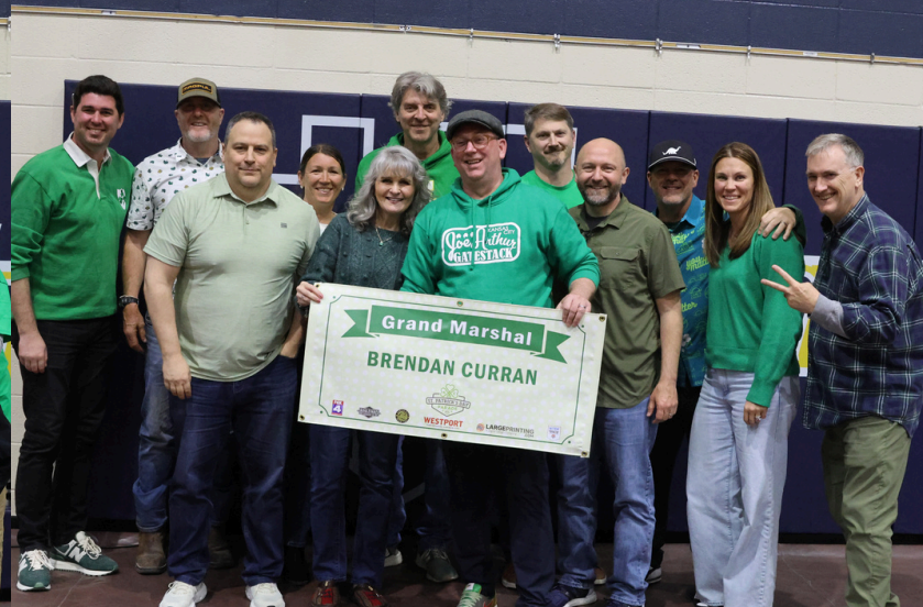
2 nd Place The Grand Marshals