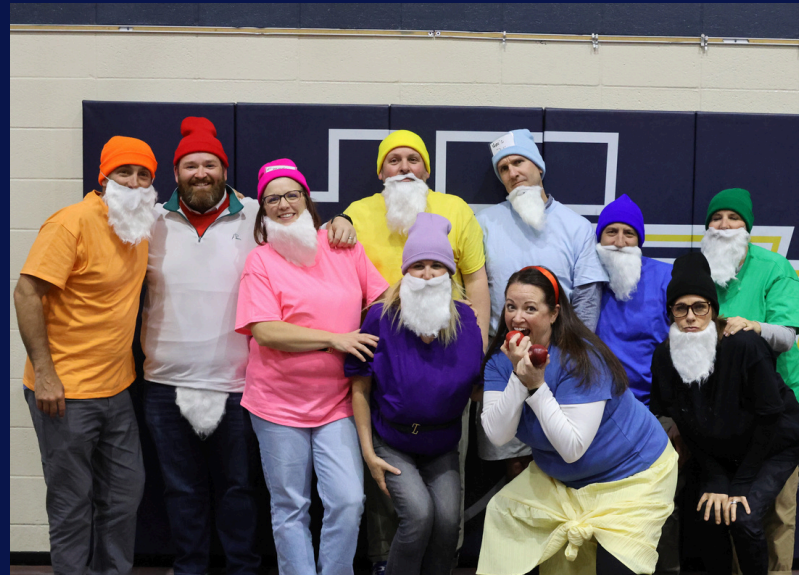
New Champions "Snows it All"