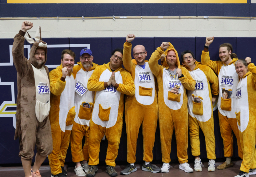
3 rd Place The Running Kangaroos