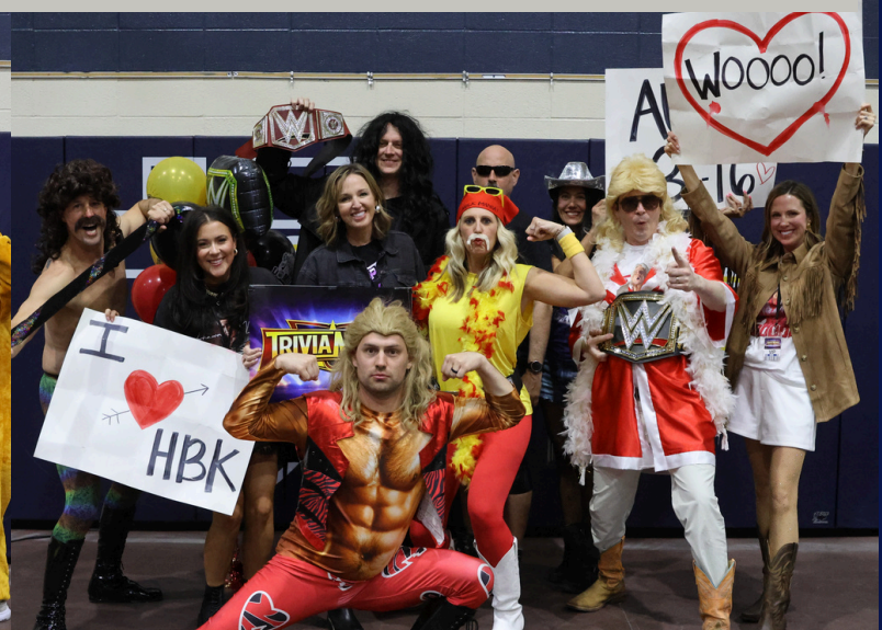
Best Themed Wrestle Mania