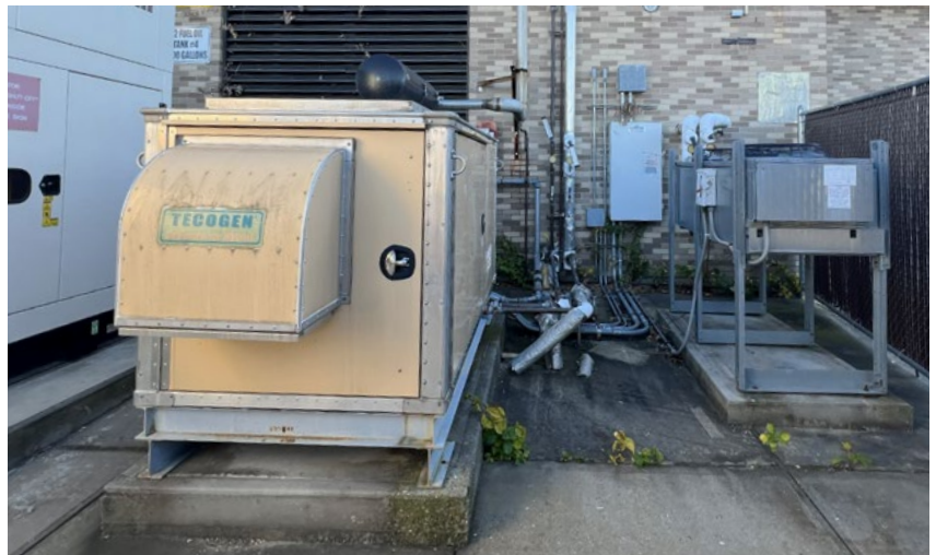
The current chiller at Centereach High School, pictured here, will be replaced with a new unit.

Additionally, through careful, self-sustaining management, we were able to upgrade food services equipment at Centereach High School, including this impressive new stove.