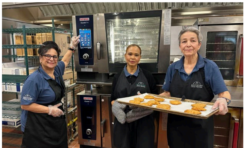
Food service employees cooked nutritious meals with the new stove at Centereach High School.