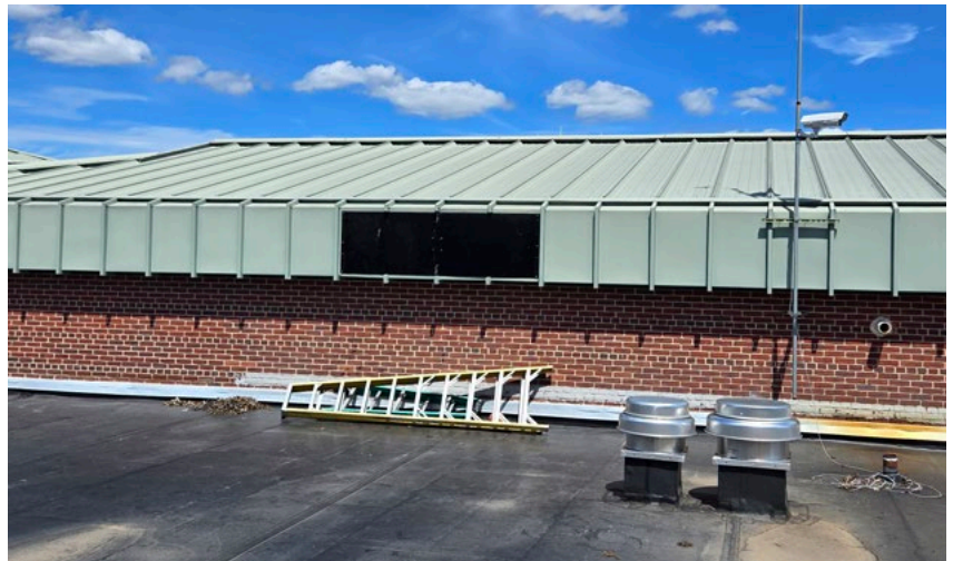
The Hawkins Path Elementary School roof will soon be upgraded.