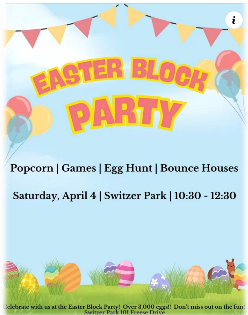
Celebrate with us at the Easter Block Party! Over 3,000 eggs!! Don't miss out on the fun! Switzer Park 101 Freese Drive

First Baptist Church Easter Block Party is on April 4th! Join us at Switzer Park on Freese Drive at 10:30 for fun, games, and of course an egg hunt! Everyone is welcome!! Hope to see you there!