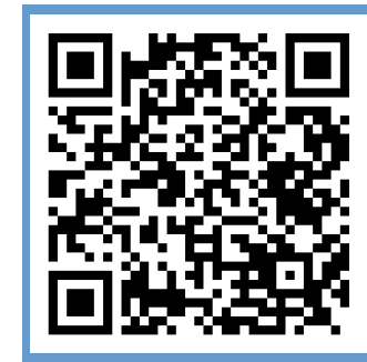
Chinese Immersion (CHIP) Application