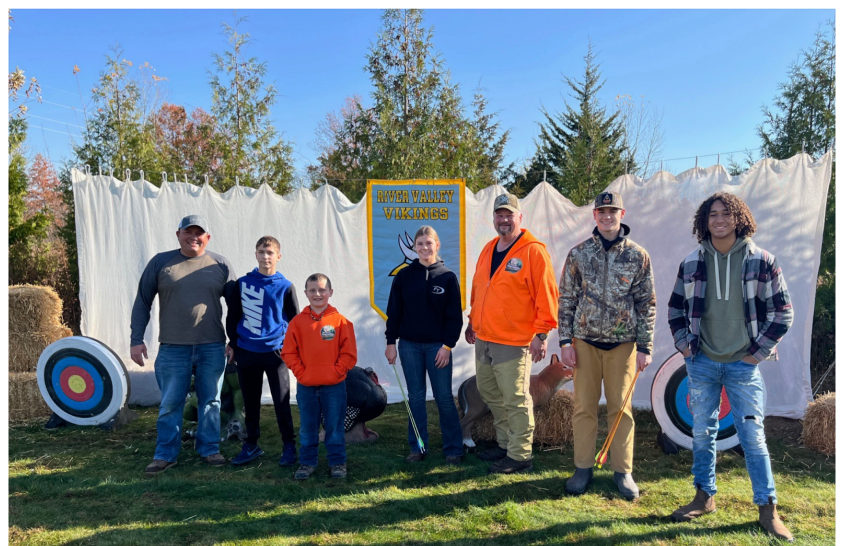
RV Archery enjoying some time at the range.

See our calendar of events at: www.rvk12.org