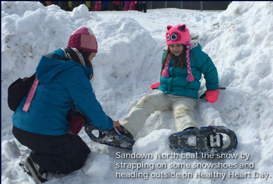
Sandown North beat the snow by strapping on some snowshoes and heading outside on Healthy Heart Day.