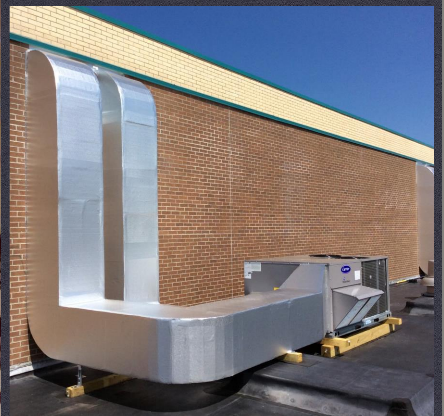
NEW ROOF TOP UNIT INSTALLATION - GYMNASIUM HIGH SCHOOL