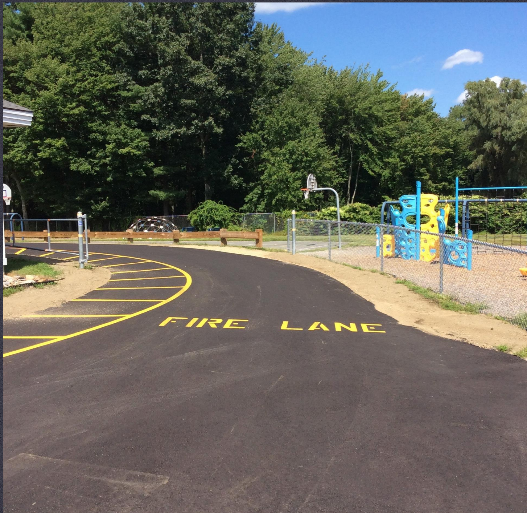
ACCESS ROAD PAVING