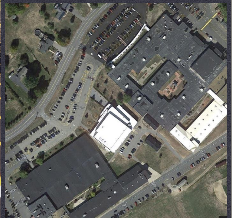
PARKING LOT - PHASE 5