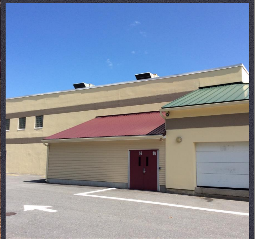
EXTERIOR PAINTING PHASE V