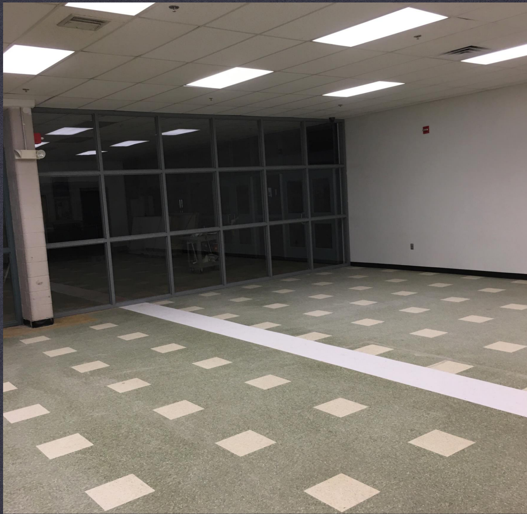
COMMON SPACE EXPANSION