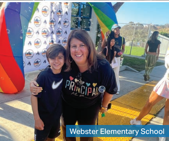
Webster Elementary School