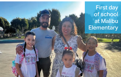
First day of school at Malibu Elementary