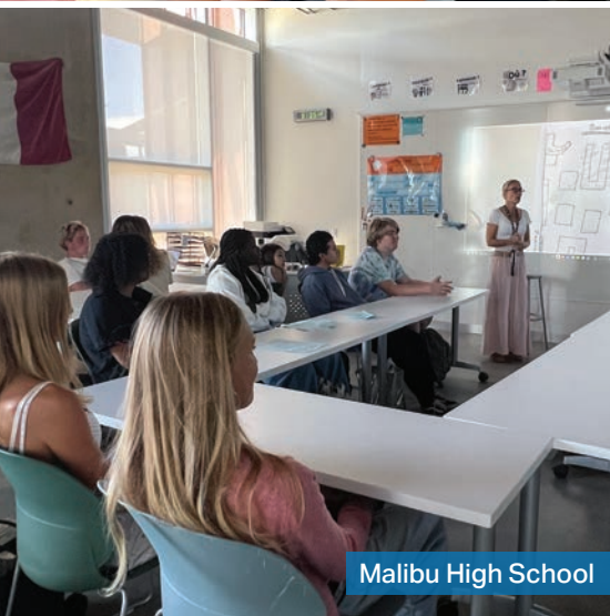
Malibu High School