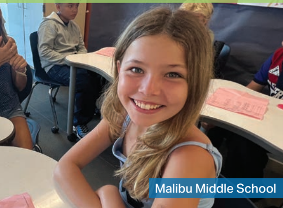
Malibu Middle School