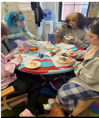
A huge success