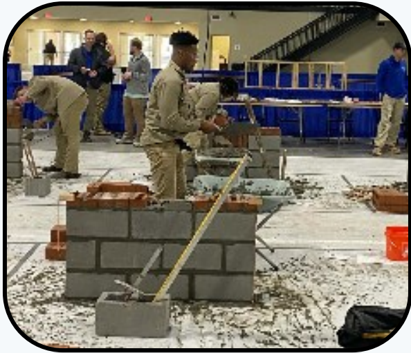
BEAUFORT-JASPER ACADEMY FOR CAREER EXCELLENCE