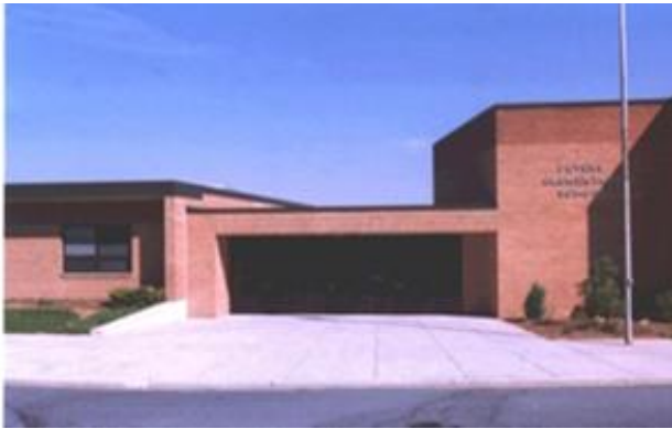
Peters Elementary School (K-2)