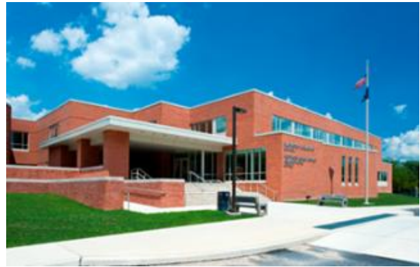
Slatington Elementary School (3-6)