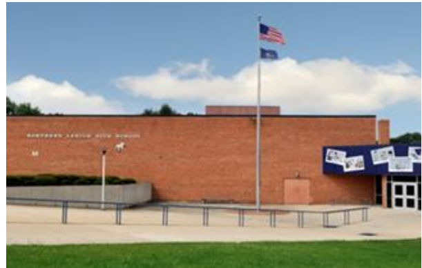
Northern Lehigh High School (9-12)