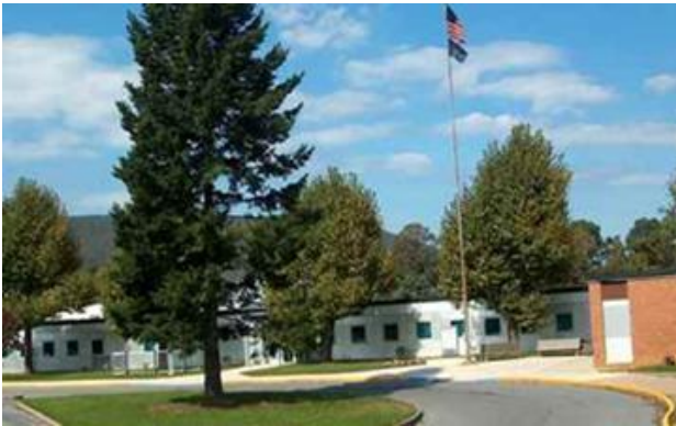
Northern Leigh Middle School (7-8)