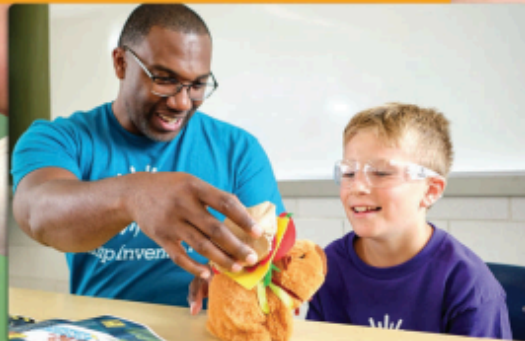
An Instructor empowers a third grader as they design their robotic capybara costumes.