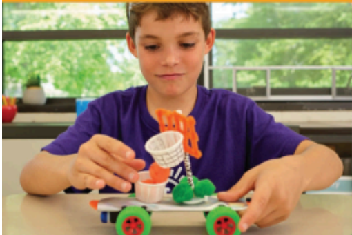
A fourth grader practices persistence while building and testing their unique invention.