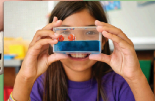
A fifth grader has fun exploring hands-on physics experiments.