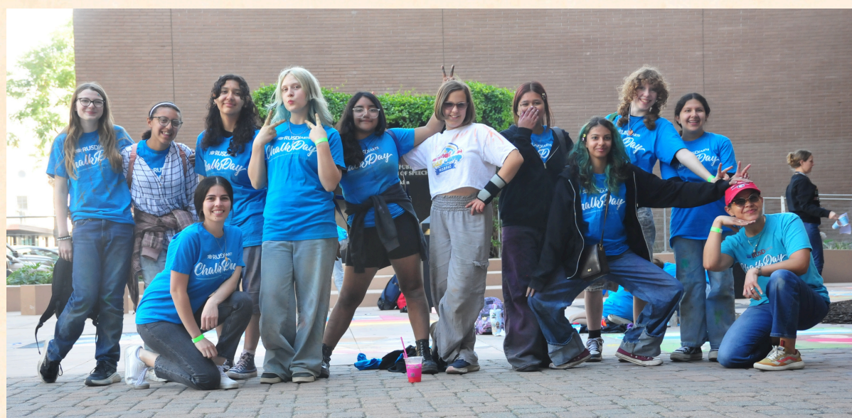
CHALK DAY ARTISTS ON MARCH 3RD