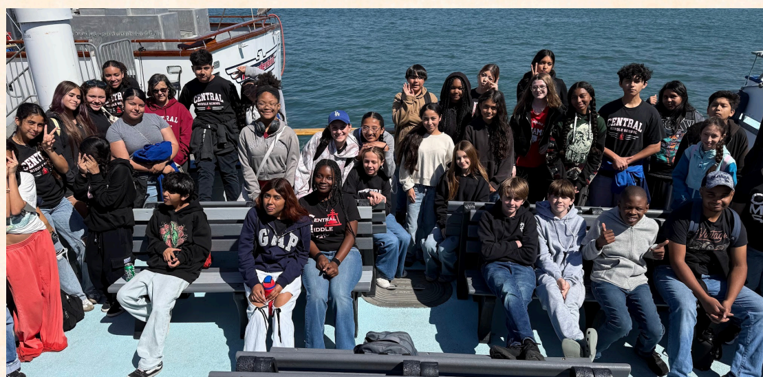
CRYSTAL COVE FIELD TRIP ON MARCH 11TH