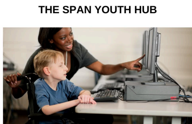
THE SPAN YOUTH HUB