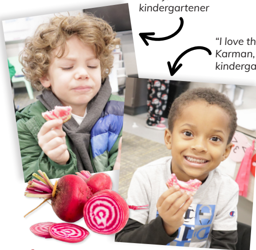
Candy Cane Beets