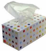
4 boxes of Tissues