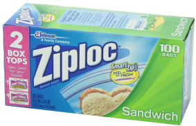
1 sandwich size Ziploc bags