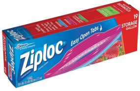
1 gallon size Ziploc bag