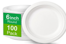
Small paper plates