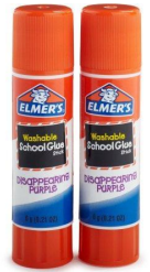
6 large Elmer's glue sticks