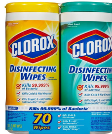
2 Clorox Wipes