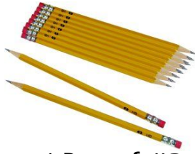
1 Box of #2 pencils