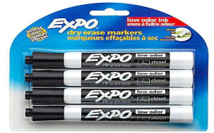
2 pack dry erase markers