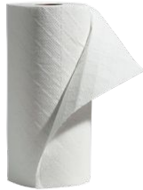
1 roll of paper towels