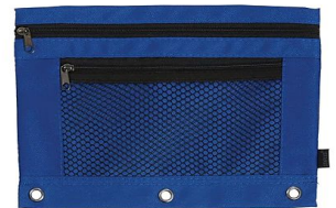
1 pencil pouch