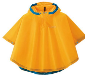
1 rain poncho