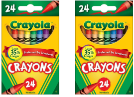
4 CRAYOLA 24 count crayons