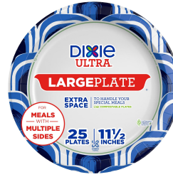
Large paper plates