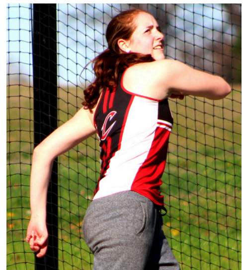
Right:... and then unleashes a personal-best toss that won the competition Thursday.