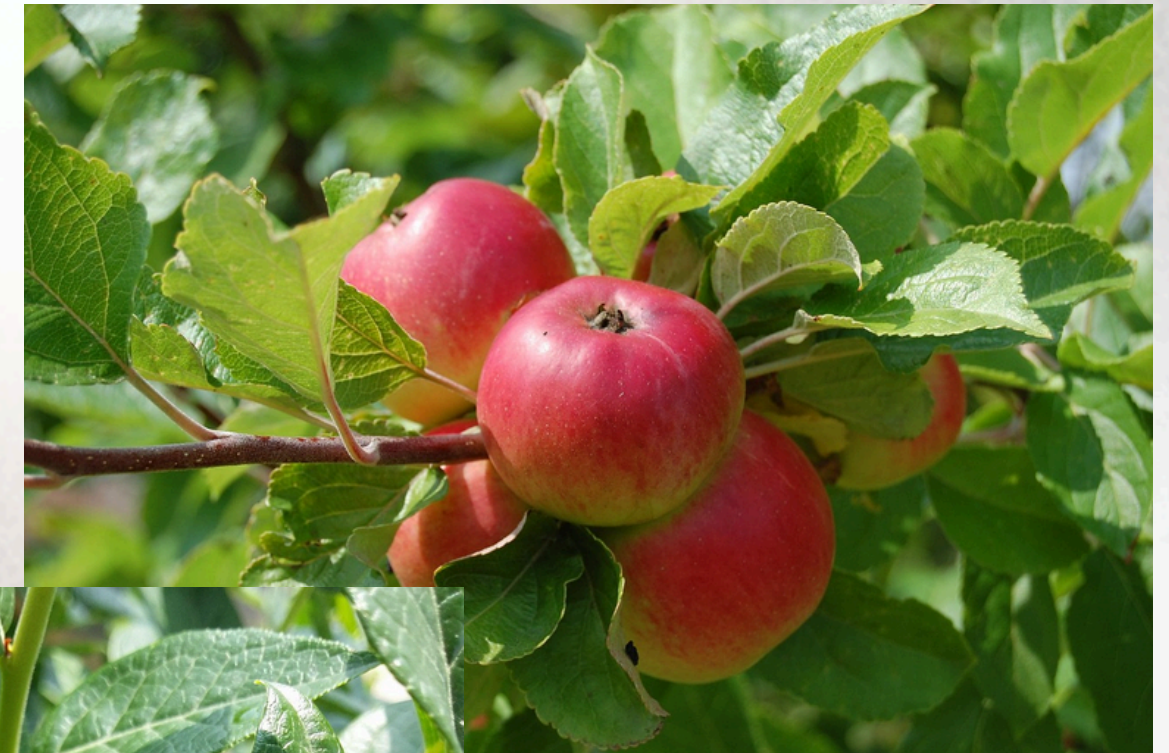
FRUIT TREES AND BUSHES