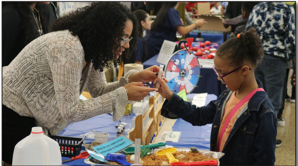
At last year's HITS Expo, a student learns about what items can be found in sand at the beach.

will be the Polyglot Games, a competition testing students' language skills, and the SeaPerch Robotics event, which demonstrates remotely operated underwater vehicles built and controlled by students.