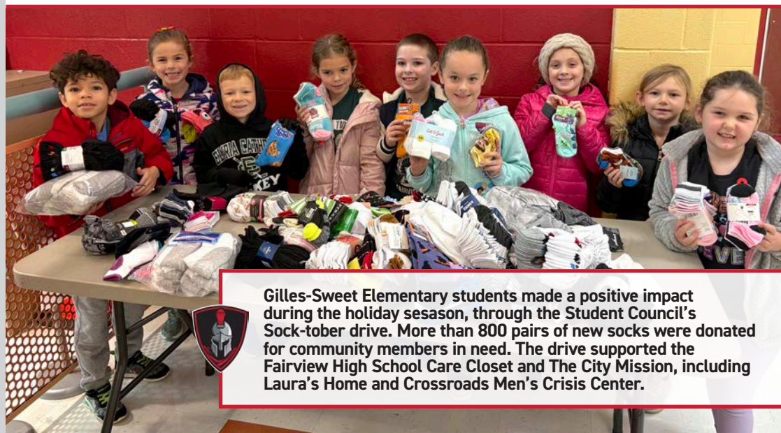
Gilles-Sweet Elementary students made a positive impact during the holiday season, through the Student Council's Sock-tober drive. More than 800 pairs of new socks were donated for community members in need. The drive supported the Fairview High School Care Closet and The City Mission, including Laura's Home and Crossroads Men's Crisis Center.