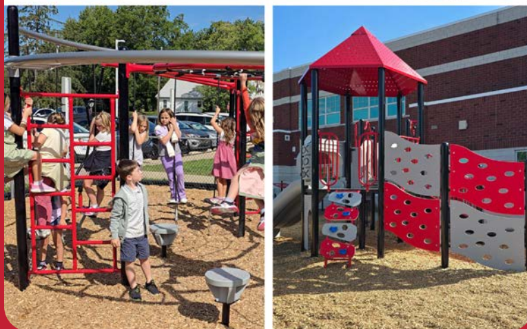
Construction on the new Gilles-Sweet Elementary playground kicked off as soon as the 2024-2025 school year wrapped up, and by Tuesday, Sept. 2, the wait was over. The first graders proudly took the first spin, climb, and swing on the brand-new equipment during its grand opening celebration.

The new Gilles-Sweet playground is an area for the community, by the community. Although the majority of the cost of construction was paid through the district's permanent improvement fund, community members and businesses contributed money to the project.