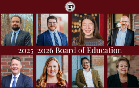
2025-2026 Board of Education