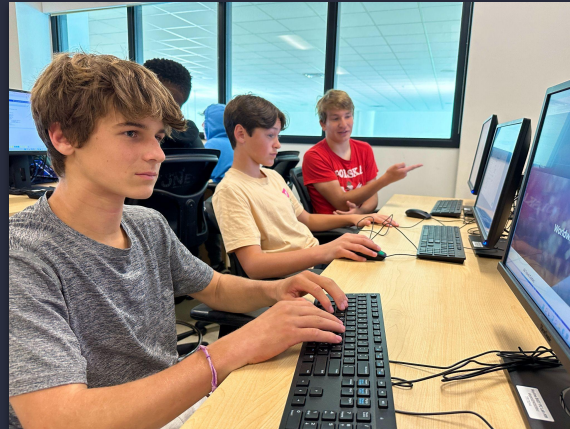
A2 Virtual+ Summer Session Fee-based 6th - 12th