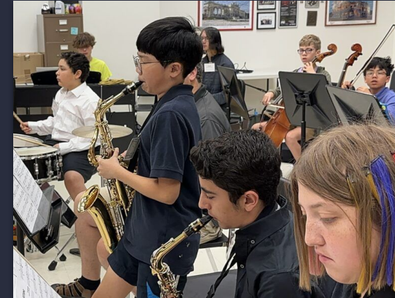
Summer Arts Program Fee-based with Scholarships 3rd - 12th