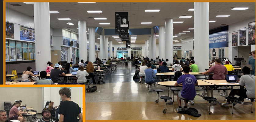
Proctoring session at Skyline High School July 25, 2025