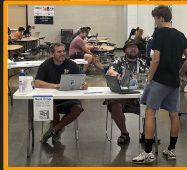
A2V+ staff checking students in for proctoring.