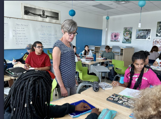
High School Summer Program Open Enrollment 9th - 12th