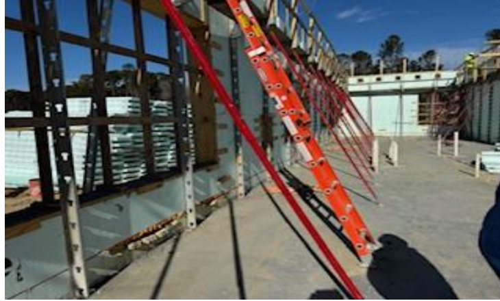
Exterior ICF Wall and Construction Scaffolding