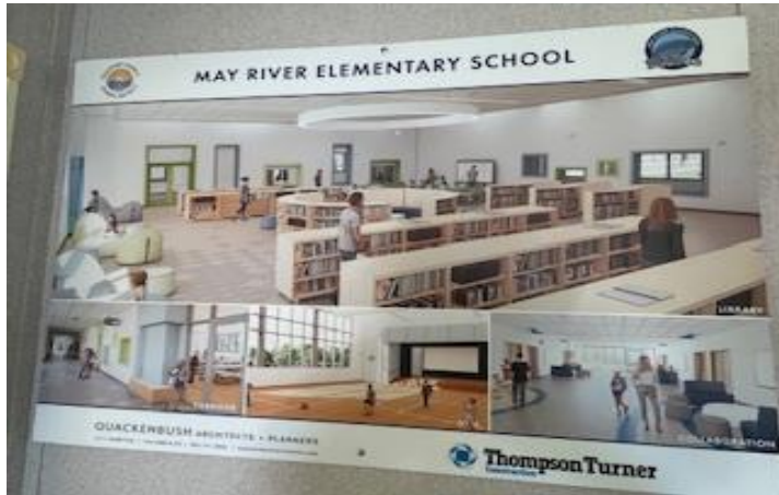
Interior Rendering of MRES in TCC Job Trailer