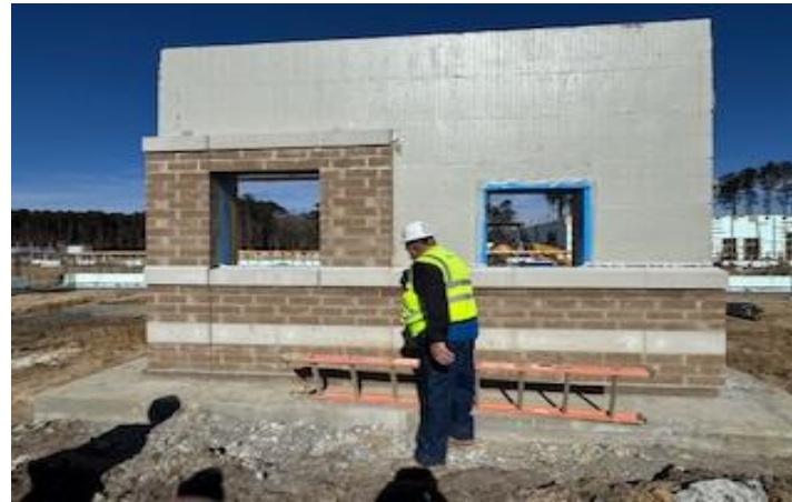
Facade Mockup Panel 60% Complete