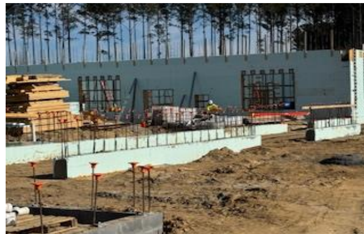
Area B1 Slab Prep and Group Restroom Slab Prep