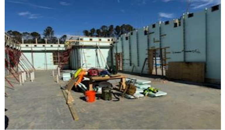
Construction Laydown and Worktables