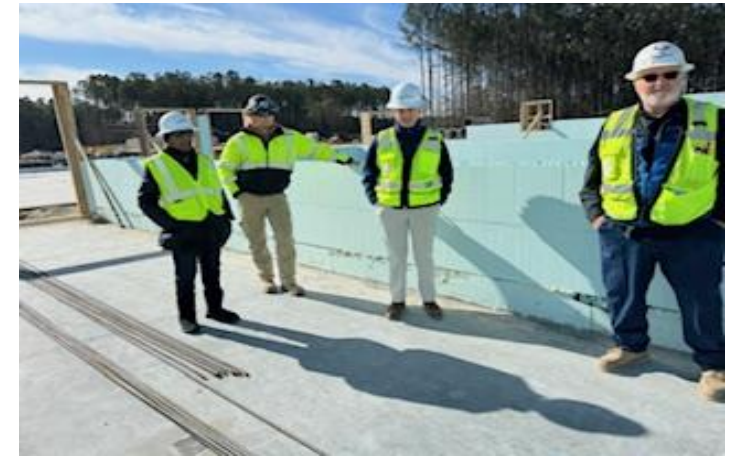
CLOC Members & Construction Team