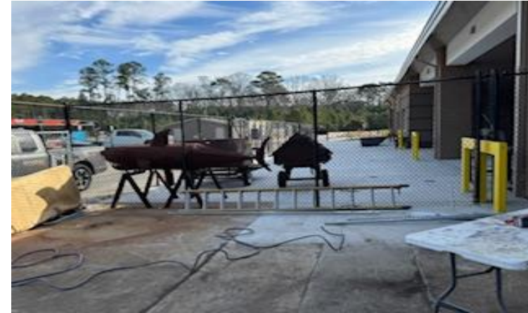
MRHD Classroom Equipment, Not Construction