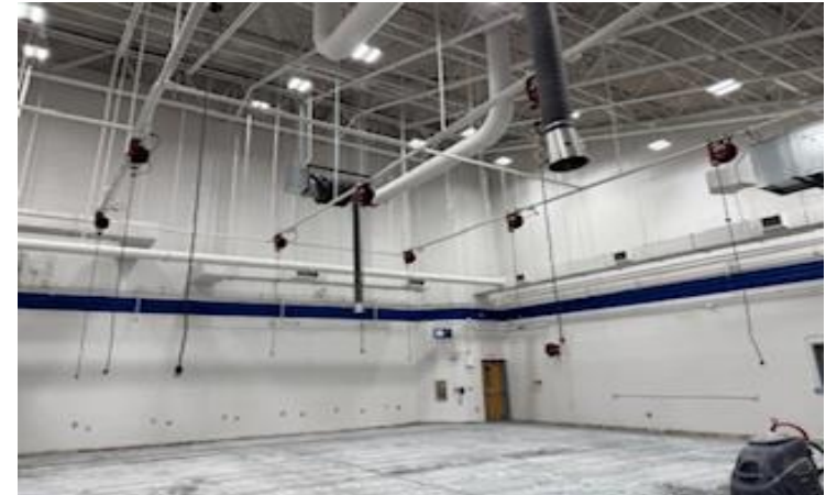
MCTE CTE Auto Renovation