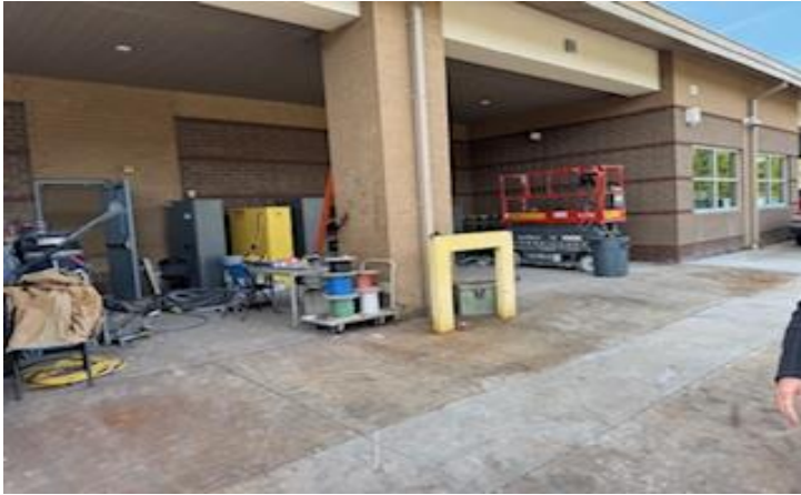
Construction Worker Laydown Area For MRHS CTE Renovation