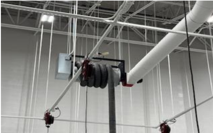
MRHS CTE Auto Exhaust