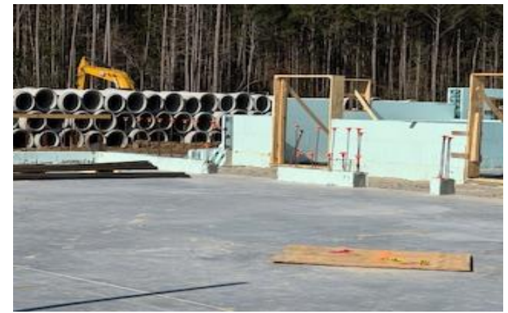
Concrete Slab Area A and RCP Pipe in Background