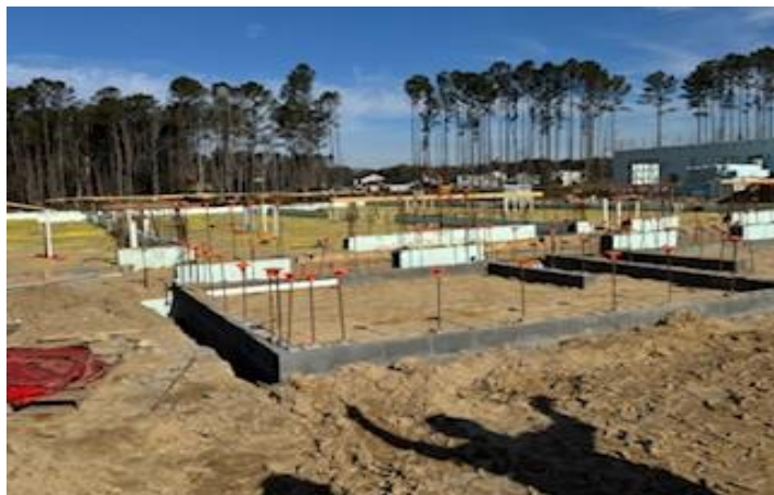
Area B1 Slab Prep and Group Restroom Slab Prep