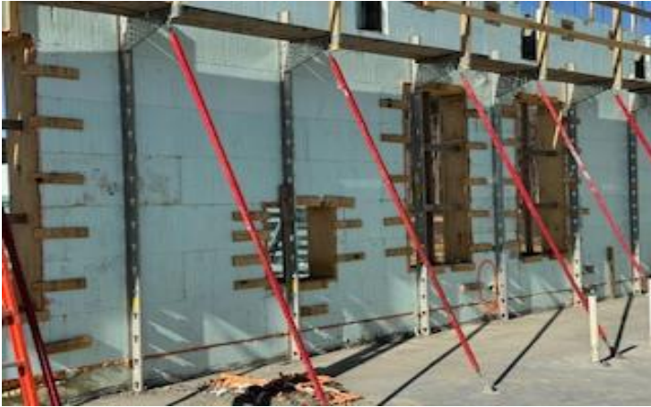
Exterior ICF Wall and Construction Scaffolding