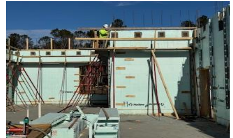
Exterior ICF Wall and Construction Scaffolding