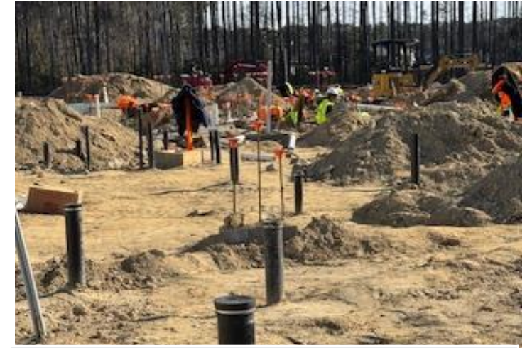
UG Plumbing Rough in Kitchen and Mechanical Area