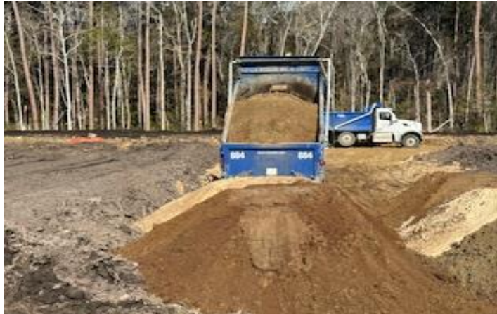
Fill Being Placed in Parent Drop off Road