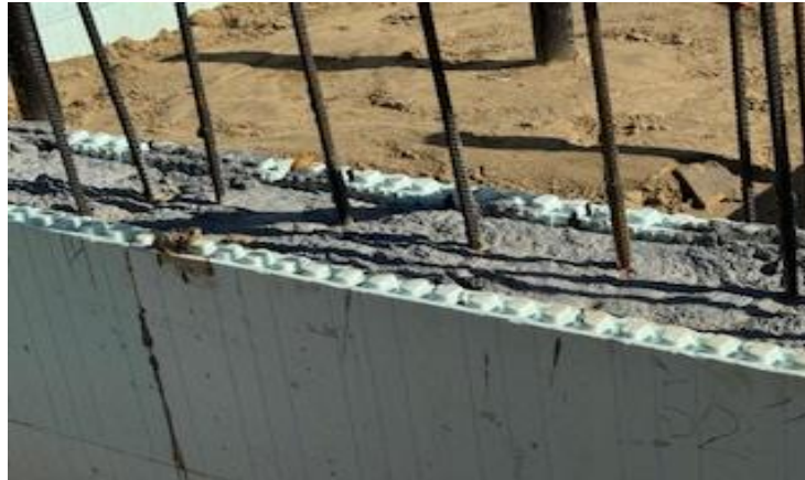
Concrete That Has Been Placed in ICF Walls Using New Method of Forming Concrete Walls