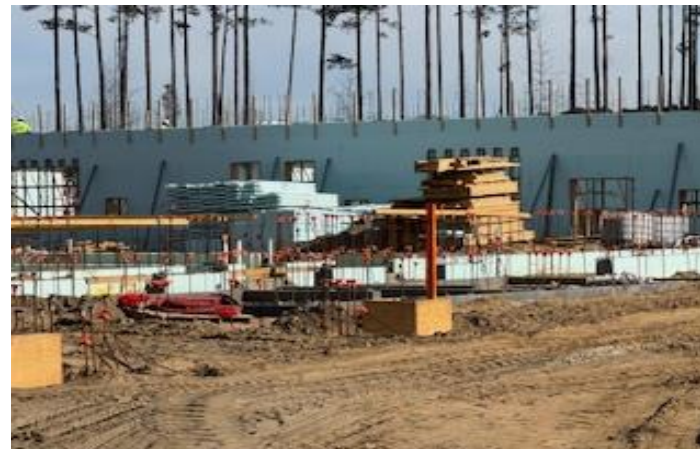
Area B Hallway Slab prep and ICF Worker Cleaning Up