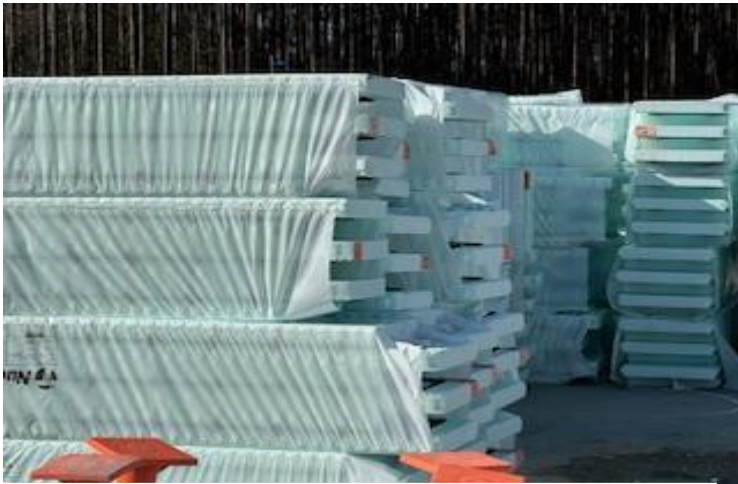
ICF Panels Stacked