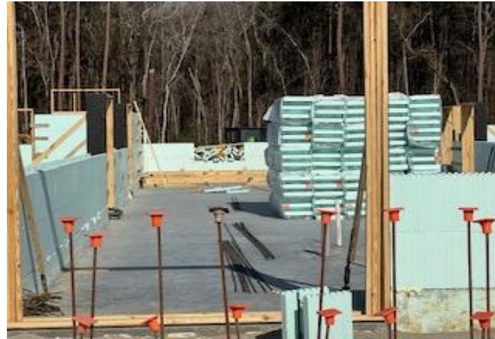
ICF Panels Stacked and ICF Rough In