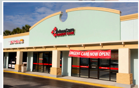
PRIMECARE • NEW SMYRNA BEACH Publix Beachside

1890 LPGA Blvd., Suite 130 • Daytona Beach, FL 32117 PHONE: (386) 274-2212 • FAX: (386) 274-1508 EMAIL: pctwinlakes@gmail.com