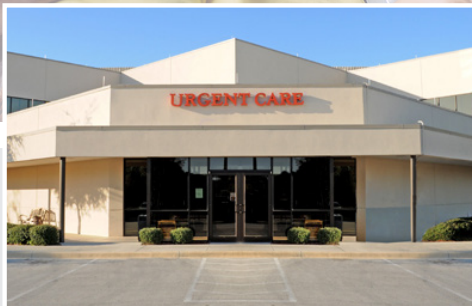
PRIMECARE • TWIN LAKES Corner of LPGA & Clyde Morris

1890 LPGA Blvd., Suite 130 • Daytona Beach, FL 32117 PHONE: (386) 274-2212 • FAX: (386) 274-1508 EMAIL: pctwinlakes@gmail.com