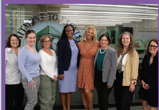
October was Board of Education Appreciation Month. Thank you Board Members!