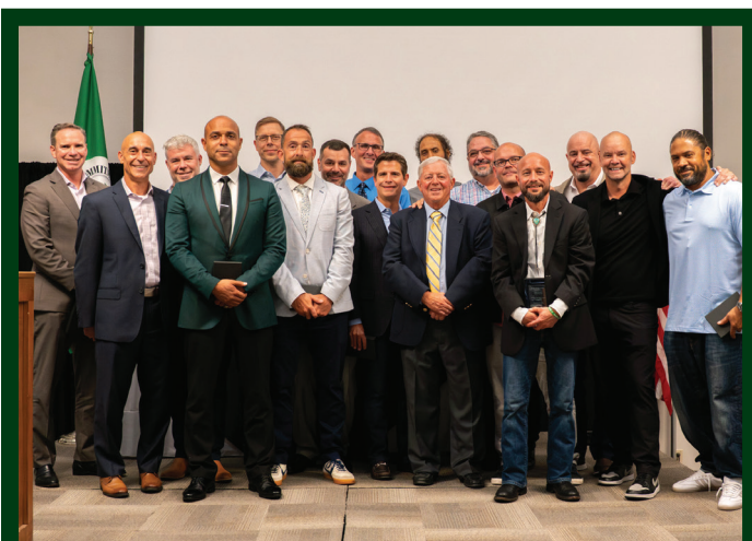
1990 & 1991 Boys Soccer Team at the 2025 Athletic Hall of Fame Induction