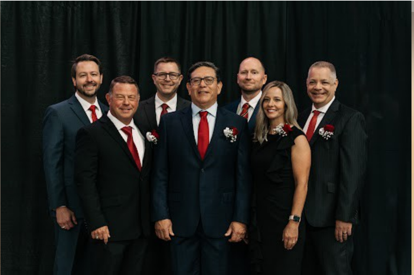
C Belton ISD Board of Trustees