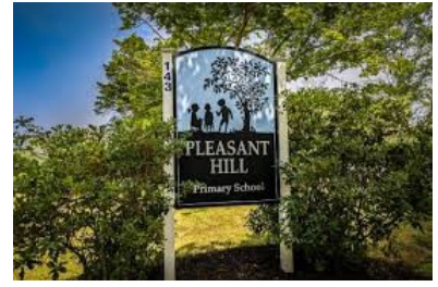
Pleasant Hill School

We are very excited to meet all the new kindergarten kids and families scheduled to join us next school year.. Please mark your calendars for our Kindergarten Information Night for parents and caregivers! The information night will help you learn more about what kindergarten will look and feel like for your child.