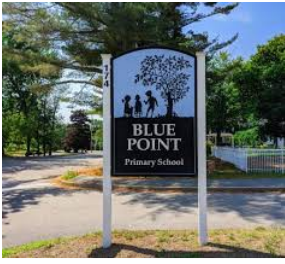
Blue Point School