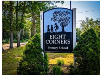
Eight Corners School