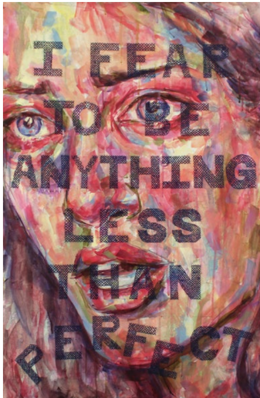
"I Fear To Be Anything Less Than Perfect"