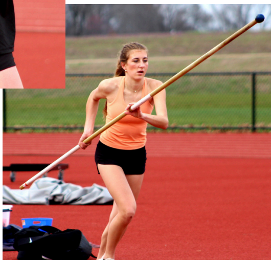
Right: A vault begins with a speedy approach down the lane, with the hands placed on the pole according to the height being attended.