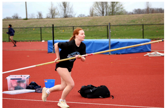
Above: As the vaulter nears the pit, the pole begins to level out in preparation for the plant into the box.