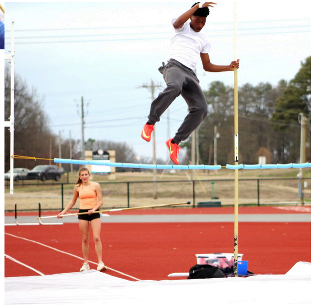
Below: If the vault goes well, the vaulter will be lifted over the bar and then simply needs to push the pole back toward the approach area during the landing.