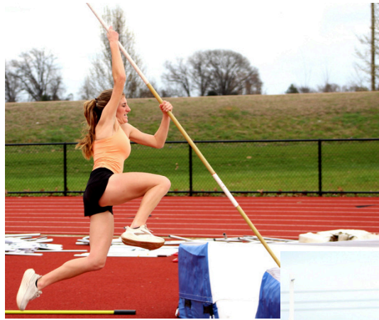
Left: As the pole is planted and the resistance meets the vaulter's hands, the vaulter jumps from the ground in unison with the bending of the pole.