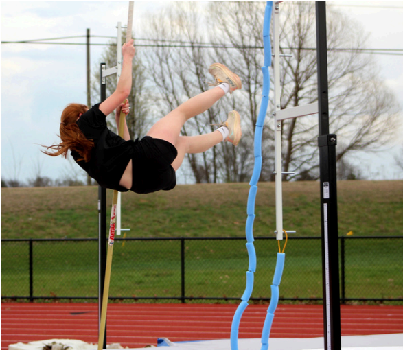
Below: The vaulter relies on the pole to provide the impetus for the left and focuses on turning the body to get the feet above the height to be cleared.