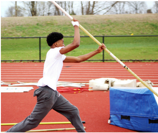
Above: With the vaulter now at full speed, the pole is directed into the plant box.