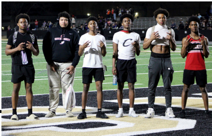
Right: One member of this group of Cavalier tracksters requested they be called "The Fast Twitchers." Who are we to argue with him?