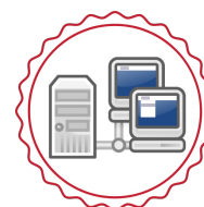
Technology Seal (Ohio)