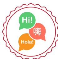
Biliteracy Seal (Ohio)