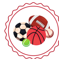
Student Engagement Seal (Local)