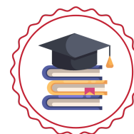
College Ready Seal (Ohio)