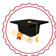
Honors Diploma Seal (Ohio)