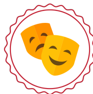
Fine & Performing Arts Seal (Local)