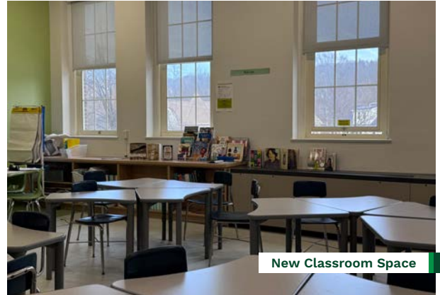
New Classroom Space