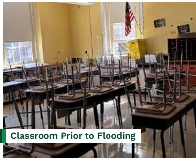
Classroom Prior to Flooding