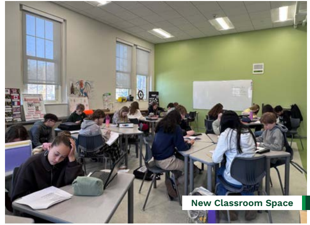
New Classroom Space

Most importantly, students have happily returned to their classrooms and are enjoying their updated space, bringing the Farragut Wing fully back to life and marking an exciting new chapter for teaching and learning.