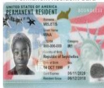
Permanent Resident Card