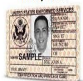
Military ID Card