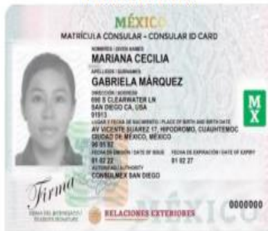
Mexico ID Card