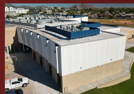
Note: Rose Lane photos are renderings.