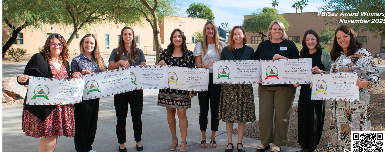
PBISaz Award Winners, November 2025