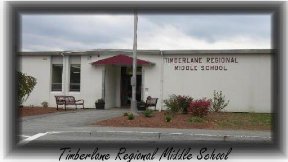
Timberlane Regional Middle School