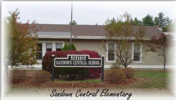
Sandown Central Elementary