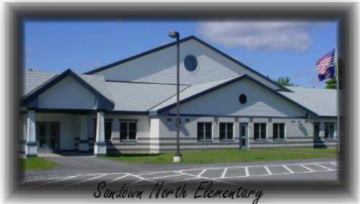
Sandown North Elementary