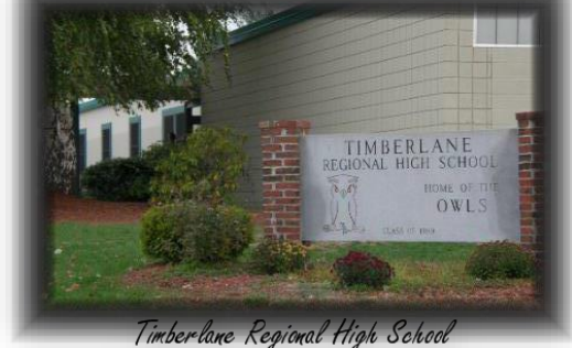
Timberlane Regional High School