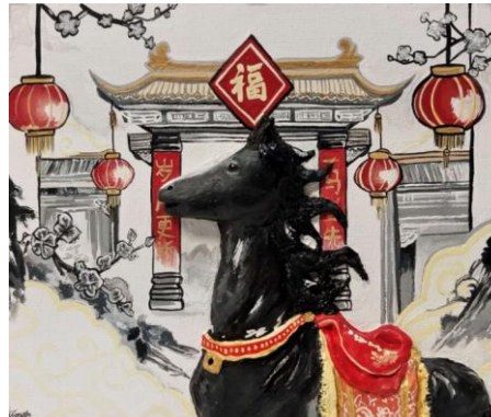
3rd Place: Fiona Li "Gallop of Good Fortune"