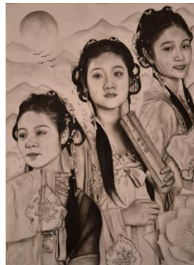
2nd Place: Chene Camp "Carrying Tradition"