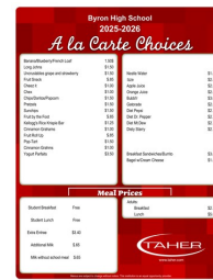
Ala Carte Choices