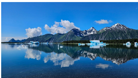
Shannon Colandrea (Gold Key)