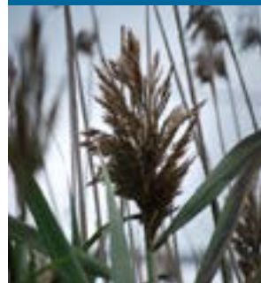
Invasive Species-Phragmites "Phragmites australis"