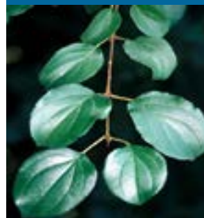
Invasive Species - Common Buckthorn "Rhamnus cathartica"